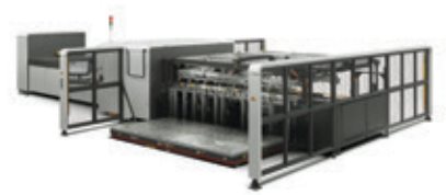
HP Scitex 15000 Corrugated Press